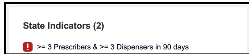
Figure 2. Prescriber and Dispenser Threshold Alerts Prior to 8/28/2025